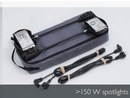
>150 W spotlights